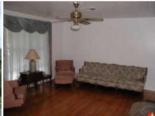
LIVING ROOM WITH HARDWOOD FLOORS