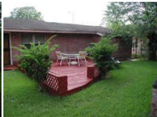
GREAT DECK FOR OUTDOOR ENJOYMENT