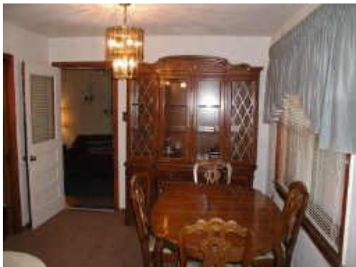
CLOSE UP OF DINING