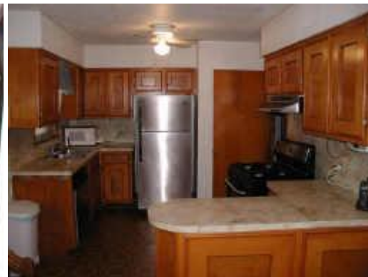
CLOSE UP OF THE KITCHEN WITH STAINLESS STEEL APPLIANCES, GREAT CABINETS