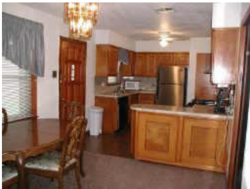
KITCHEN DINING COMBO