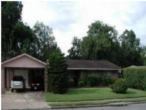
AN AFFORDABLE UPDATED HOME IN SOUTHEAST HOUSTON, SEE VIRTUAL TOUR