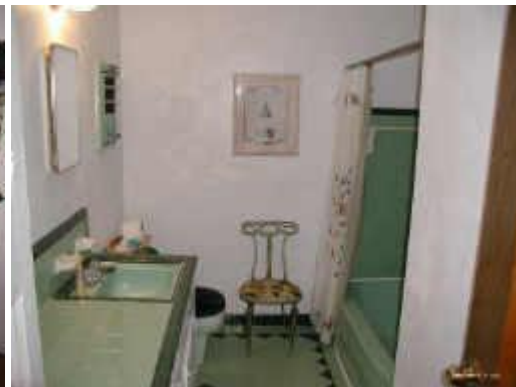
ORIGINAL BATH IN GREAT SHAPE