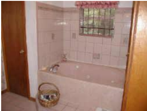
LARGE GARDEN TUB IN MASTER