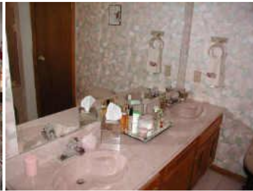
MODERN BATH WITH DOUBLES SINKS