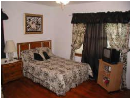
13X10 3RD BEDROOM