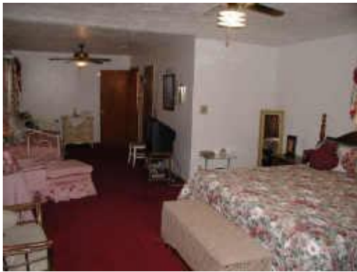
29X13 MASTER BEDROOM