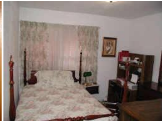
13X11 2ND BEDROOM