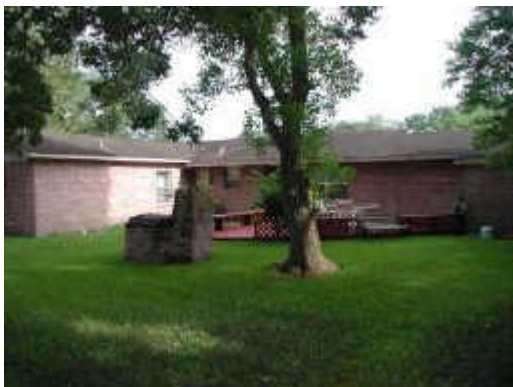
POOL SIZE BACKYARD